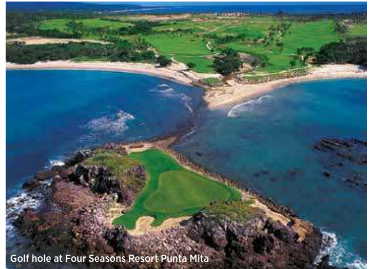
Golf hole at Four Seasons Resort Punta Mita