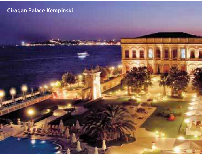
Ciragan Palace Kempinski