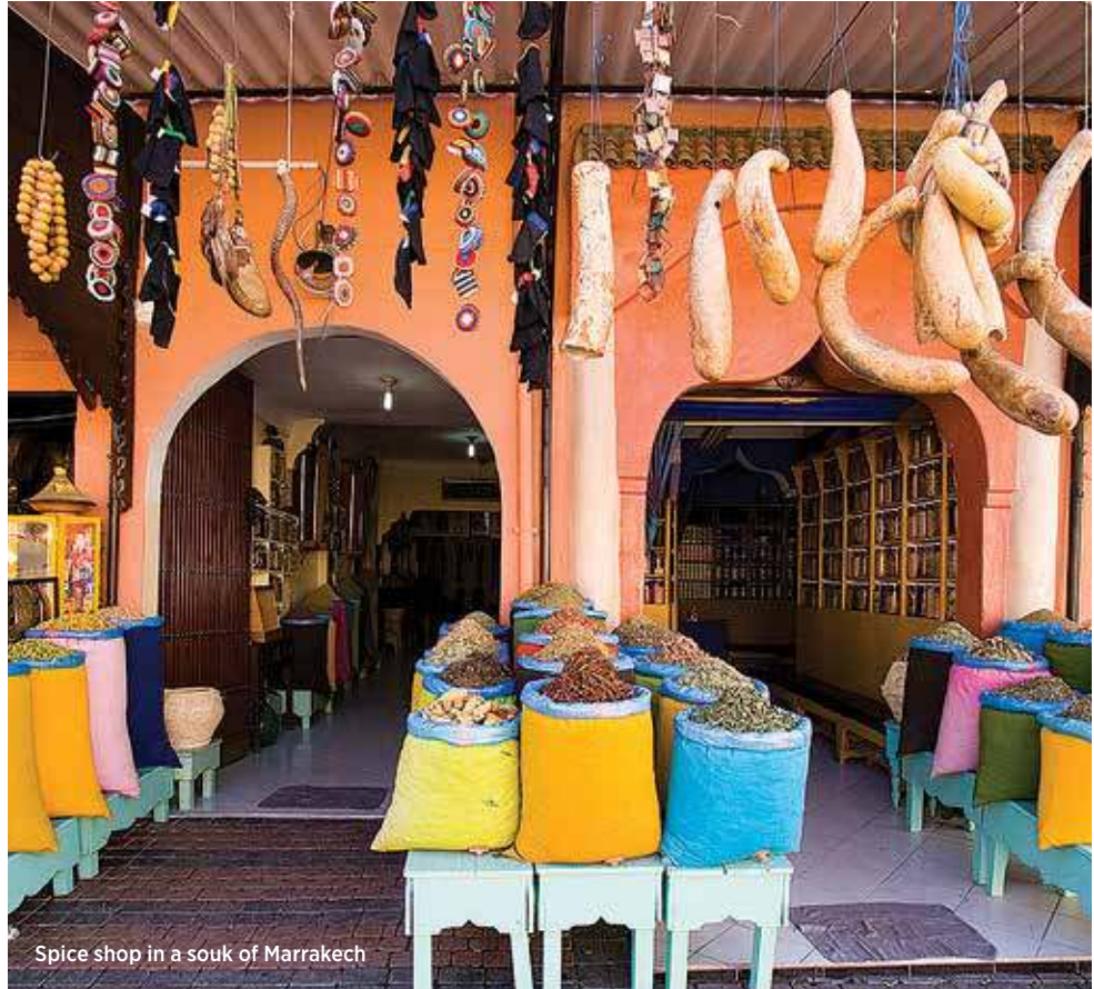
Spice shop in a souk of Marrakech