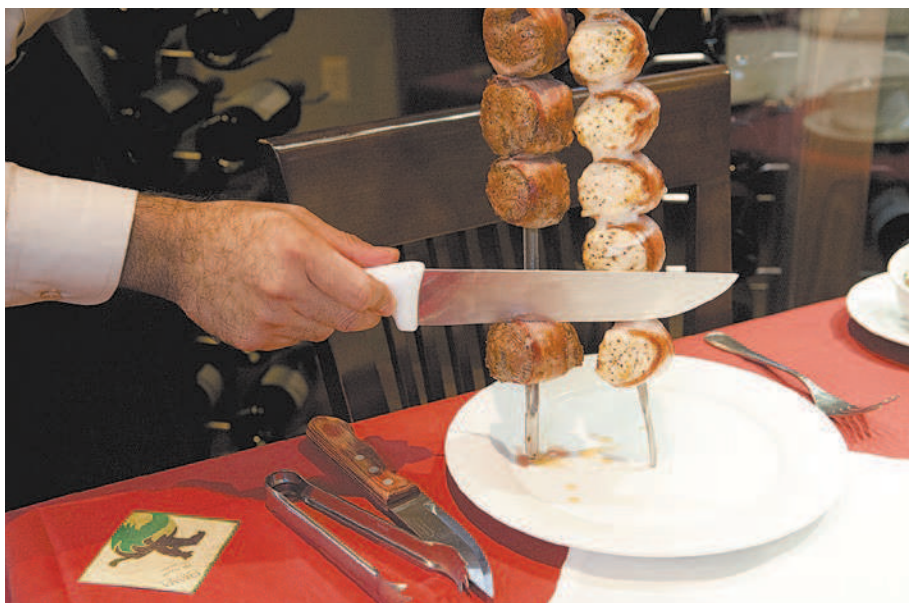
Buckhead welcomes Brazilian steakhouse Chama Gaucha.