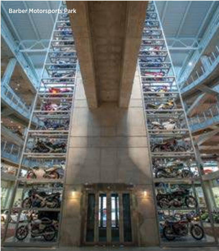
Barber Motorsports Park