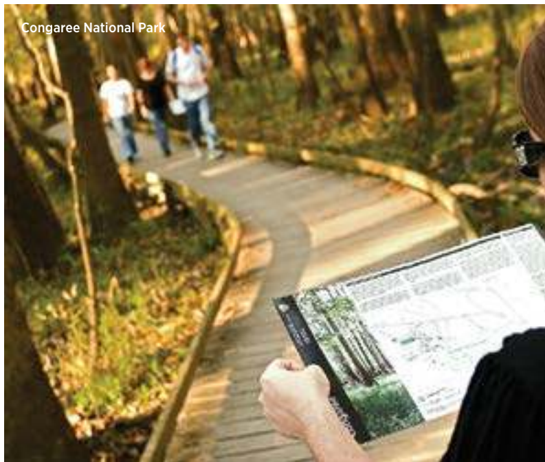
Congaree National Park