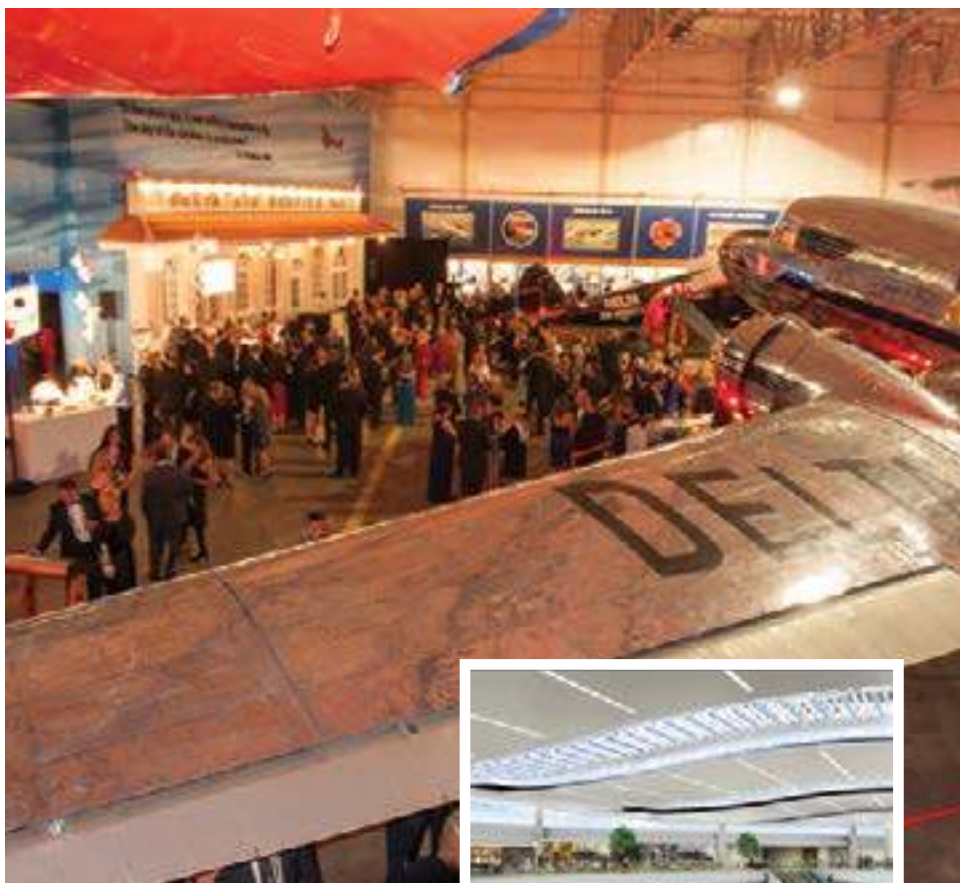
From top Delta Flight Museum; Hartsfield-Jackson Atlanta International Airport.