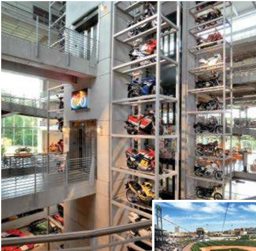
From top: Barber Motorsports Park; Regions Field.