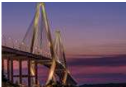
Clockwise from right: Chicken and waffles at Husk; The Cedar Room event space; Arthur Ravenel Jr. Bridge.