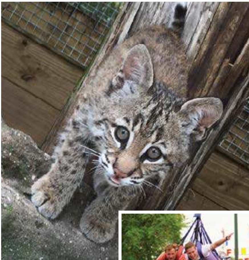
From top: Bobcat kitten at Wild Florida Airboats & Wildlife Park; world's tallest skycoaster at Fun Spot America.