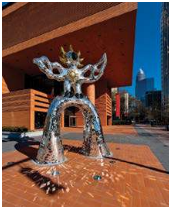
Clockwise from top: Bechtler Museum of Modern Art; U.S. National Whitewater Center; NC Music Factory.

➤ A 20-story, dual-branded hotel tower at EpiCentre, set to open in 2016, will include a 182-room AC Hotel and a 120-room Residence Inn.