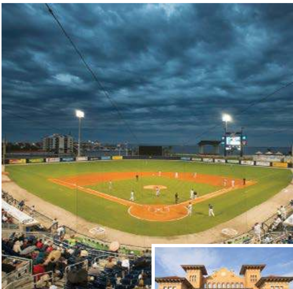
Left to right: Pensacola Bayfront Stadium; T.T. Wentworth Jr. Florida State Museum; Pensacola Beach sign; Pensacola coastline; Blue Angels aircraft.